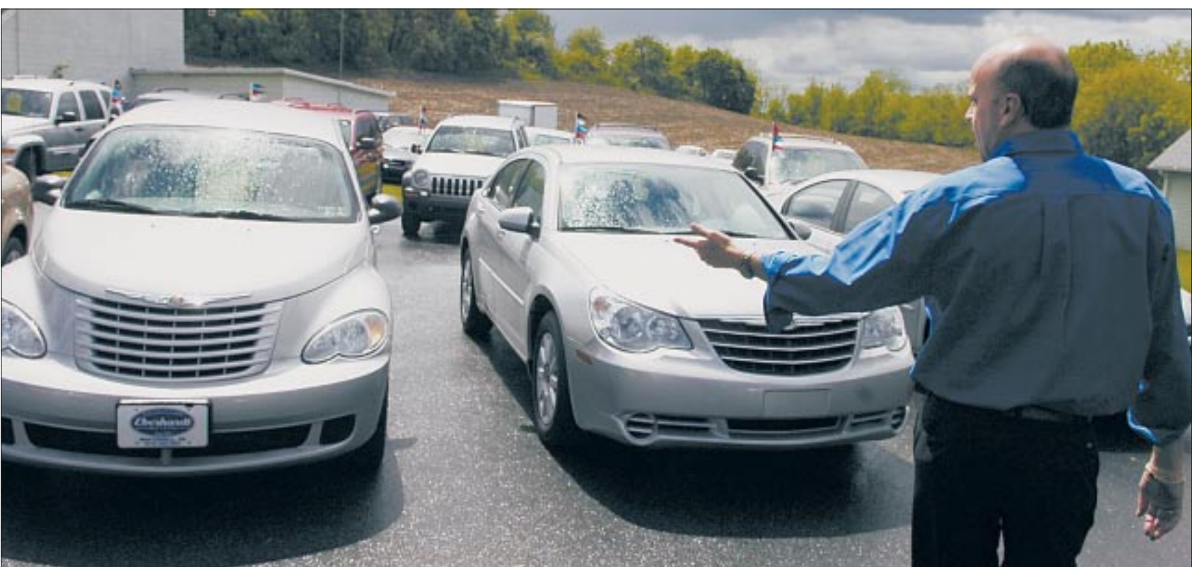
FUEL-EFFICIENT CARS such as Honda Civics, Dodge Neons and Chevrolet Cavaliers are the must-haves at used car lots as gas prices approach $4 a gallon. Eric Eberhardt, owner of Eberhardt Motors on Main Street in Egypt, shows the available used cars on his lot in Whitehall Township.